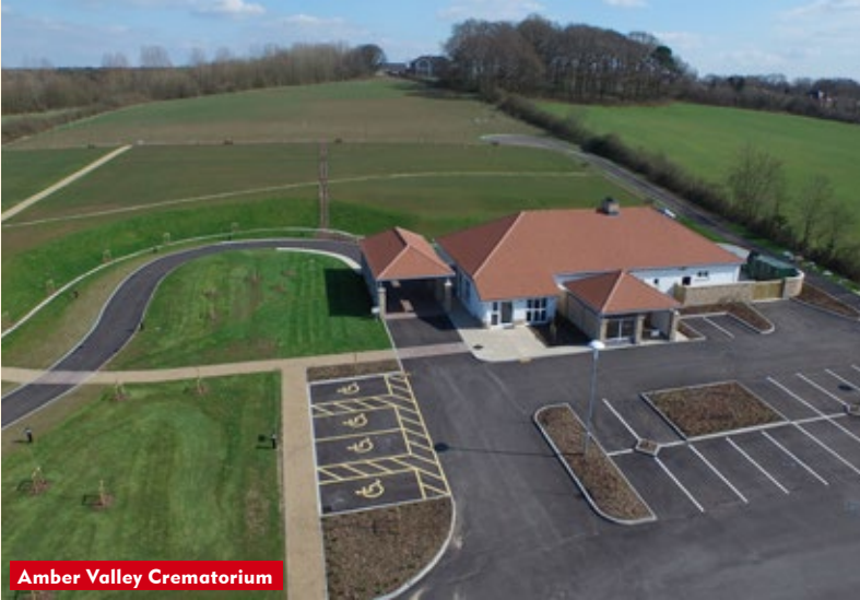
Amber Valley Crematorium